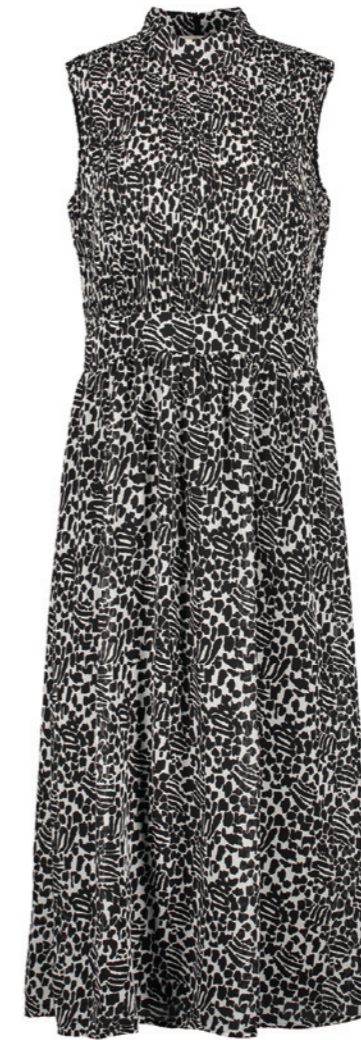
DRESS 480400 11200 1102 100 % PES