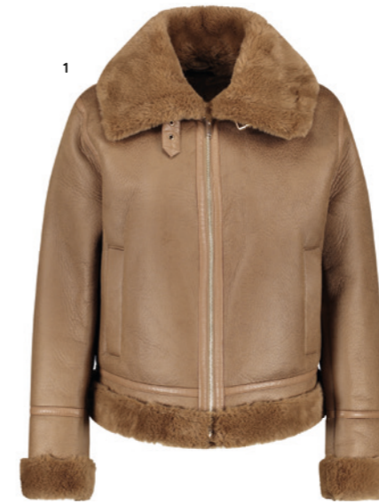
1 / JACKET 450407 11712 7380 100 % PES