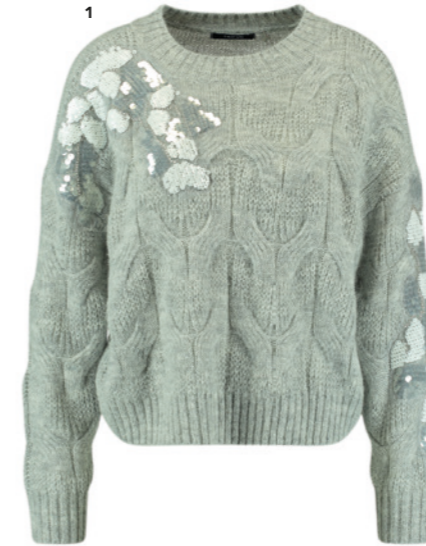
1 / PULLOVER 72413 15312 2242 39 % PAN, 36 % PA, 20 % WO, 5 % WP