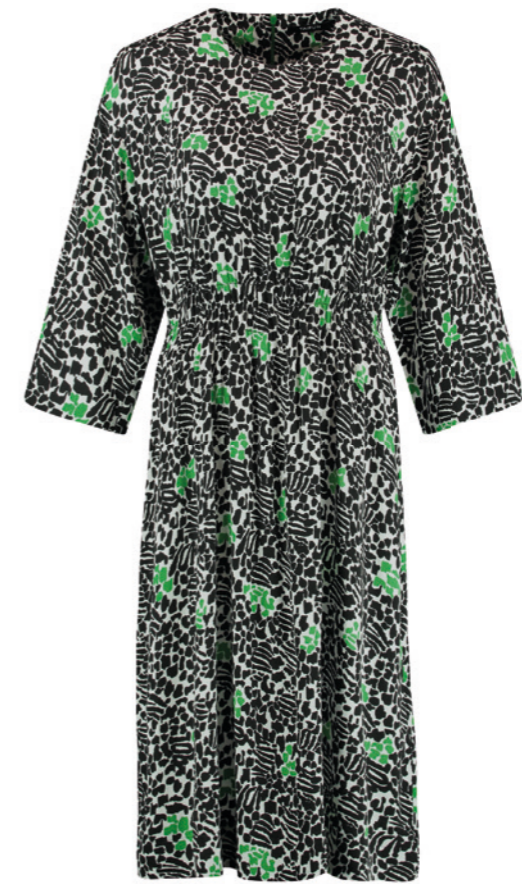
DRESS 480408 11211 5582 100 % CVE