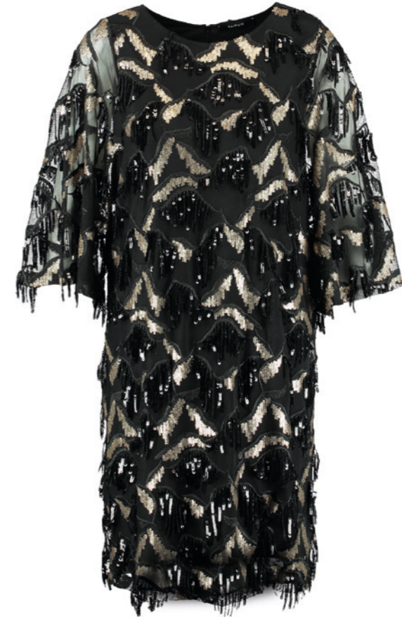
DRESS 481410 16328 1102 92 % PES, 8 % EL