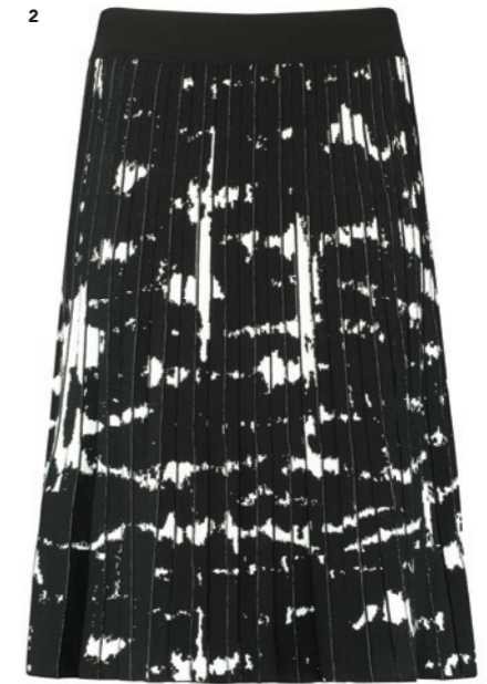
2 / SKIRT 412400 15302 1102 60 % CV, 40 % CO