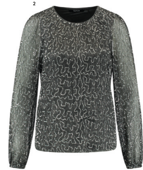
2 / BLOUSE 471423 16325 2250 55 % PES, 45 % MPES