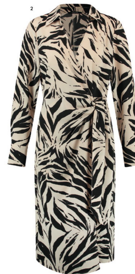
2 / DRESS 480407 11259 1102 92 % PES, 8 % EL