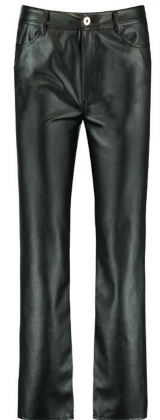
3 / TROUSERS 420416 11261 1100 100 % PES