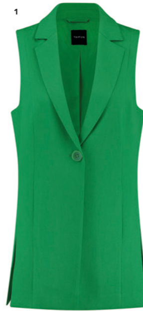
1 / WAISTCOAT 440450 11253 5580 100 % PES