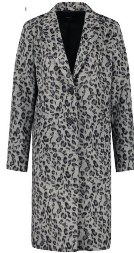
1 / COAT 450409 11714 2202 100 % PES