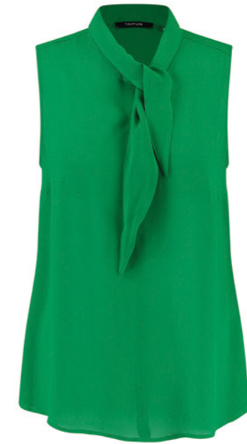
BLOUSE 460403 11203 5580 100 % CV