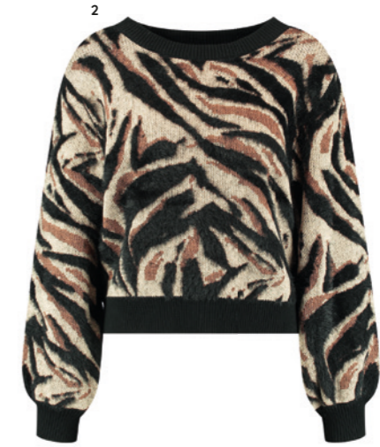
2 / PULLOVER 472412 15311 7382 44 % PA, 37 % CO, 19 % CV