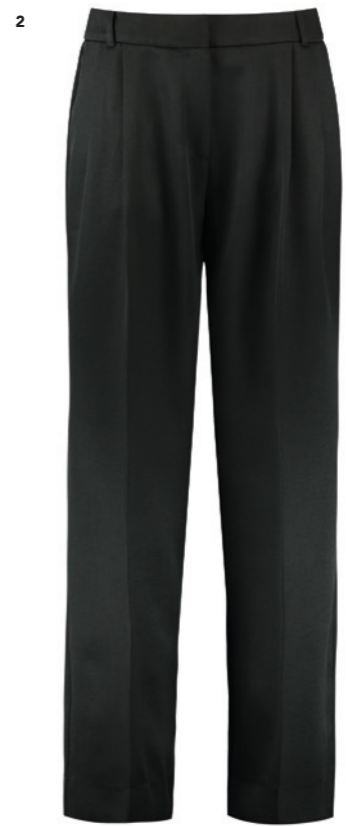
2 / TROUSERS 420412 11253 1100 100 % PES