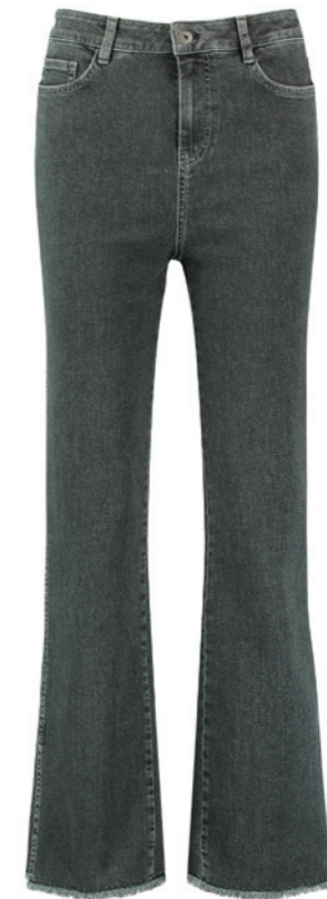
3 / TROUSERS 420408 11283 2989 98 % CO, 2 % EL