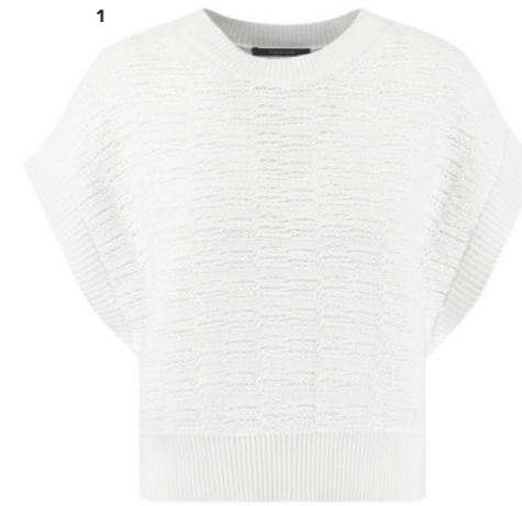
1 / PULLOVER 412401 15301 9700 100 % COBG