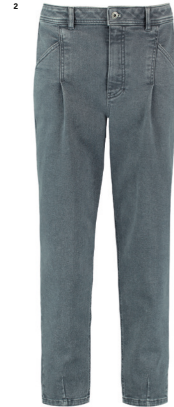
2 / TROUSERS 420407 11282 2969 93 % COB, 5 % PES, 2 % EL