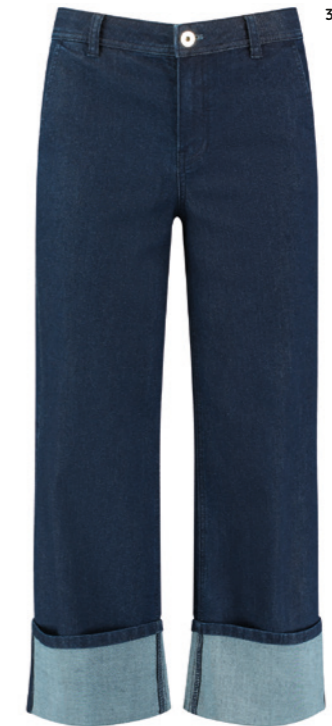
3 / TROUSERS 420410 11285 8989 66 % CO, 24 % PES, 9 % CV, 1 % EL