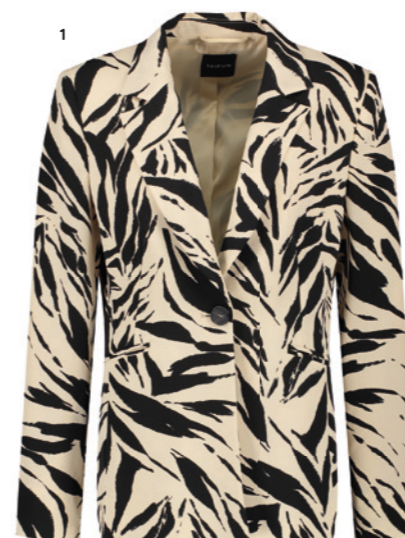
1 / BLAZER 430405 11259 1102 92 % PES, 8 % EL