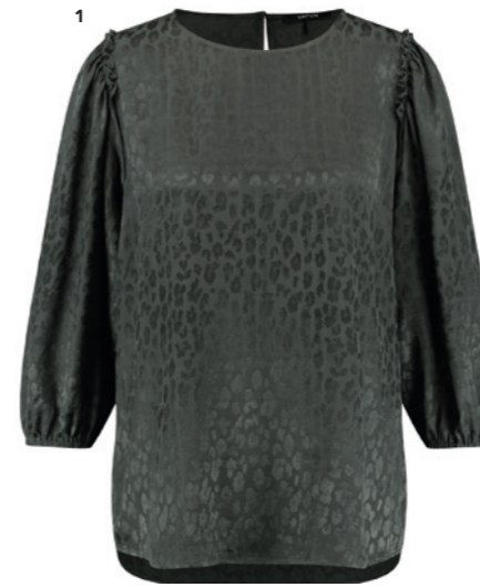
1 / BLOUSE 460406 11205 2250 100 % CV