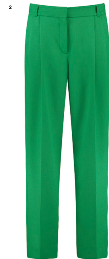
2 / TROUSERS 420412 11253 5580 100 % PES