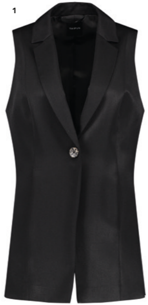
1 / WAISTCOAT 440450 11253 1100 100 % PES