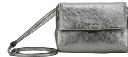
BAG, DELIVERY NOVEMBER 800037 21011 204720 100 % PU