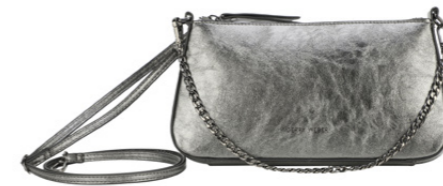
BAG, DELIVERY NOVEMBER 800036 21011 204720 100 % PU