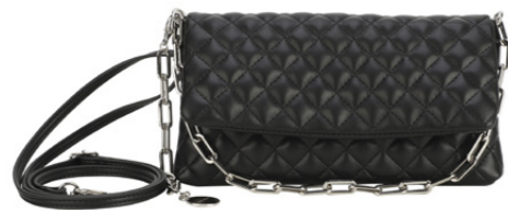
BAG, DELIVERY OCTOBER 800031 21011 11000 100 % PU