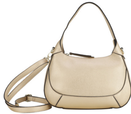
BAG, DELIVERY NOVEMBER 800038 70196 70196 100 % PU