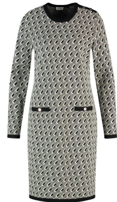
DRESS 480044 35714 9179 62 % CV, 38 % PES