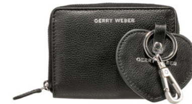
BAG, DELIVERY OCTOBER 800032 21010 11000 100 % LED