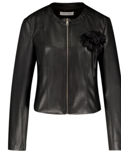
JACKET 430026 31227 11000 100 % PES