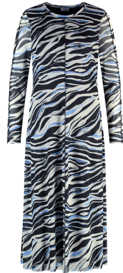
DRESS 380013 44050 1142 93 % PESR, 7 % EL