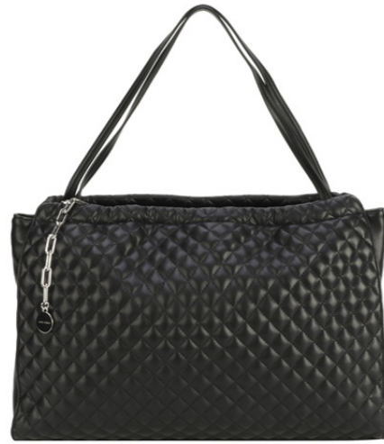
BAG, DELIVERY OCTOBER 800028 21011 11000 100 %PU