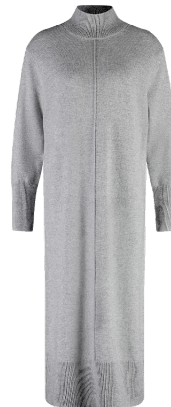
DRESS 385154 44715 204720 35 % PA, 33 % WO, 32 % PAN