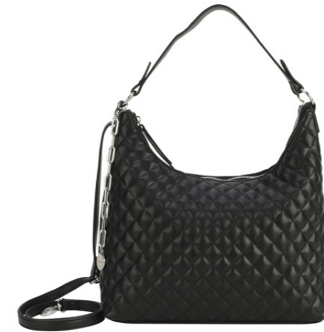
BAG, DELIVERY OCTOBER 800030 21011 11000 100 % PU