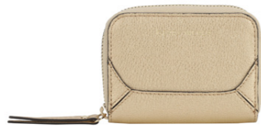
BAG, DELIVERY NOVEMBER 800040 21011 70196 100 % PU