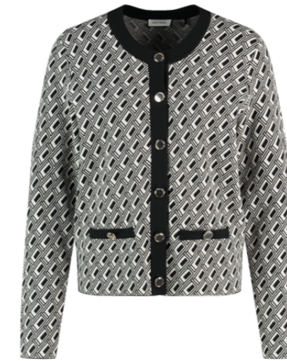
CARDIGAN 430134 35714 9179 62 % CV, 38 % PES