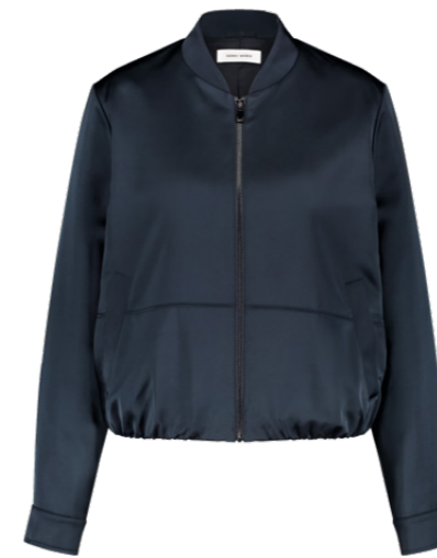
JACKET 430028 31262 80890 64 % CV, 36 % PES